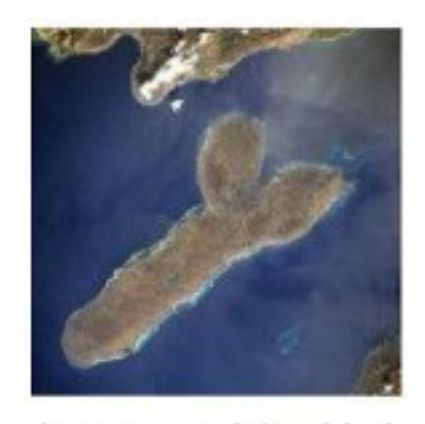
Imagne your penis is an island

The island gets all its supplies from the mainland and should anything goes wrong with the mainland, your little island feels the strain straight away. This is a fasinating analogy worth remembering.