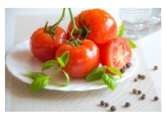
Lycopene rich foods

Lycopene is an anti oxidant found in reddish vegetables and fruit like tomatoes, ketchup, pink grapefruit, guava.