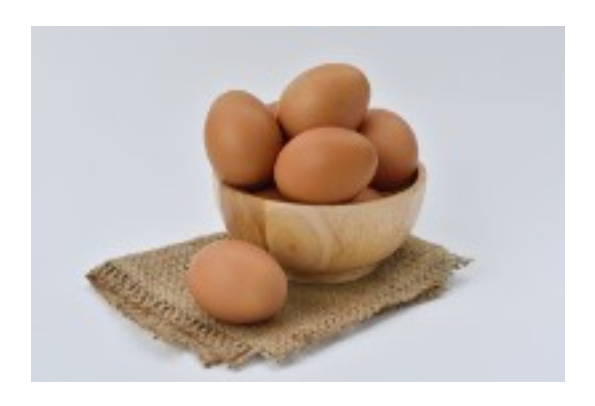
Eggs are rich in selenium

Selenium is an essential mineral that must be obtained through your diet. It has many vital health benefits and one of them is that it is beneficial to reproductive health in men.